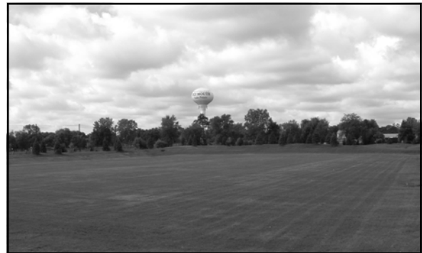
Lake Pointe Soccer Park offers two soccer fields for league play, a picnic and children's play areas, restrooms, and a shelter available for rental.