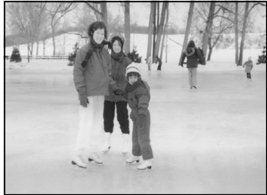
An ice skating rink is one of the new attractions to Plymouth Township Park this year.

Some of the many features of the park include one large and one smaller soccer fields, surrounded by a walking path. There are restrooms and a shelter, which is available for rental. A picnic and children's play area are also on site to make it a family-friendly place. For further information on the park, shelter reservations and use of the soccer fields, contact Susan Vignoe at 453-8131, ext. 33.