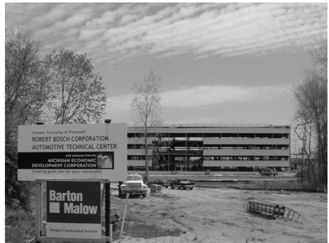
Construction of the Robert Bosch Corporation Automotive Technical Center began in 2006. Located on Five Mile Road and Haggerty Road, it is expected to be operational in 2007.